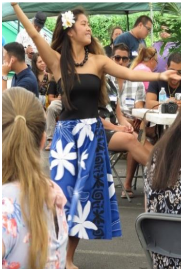
Just so lovely...Mahalo!