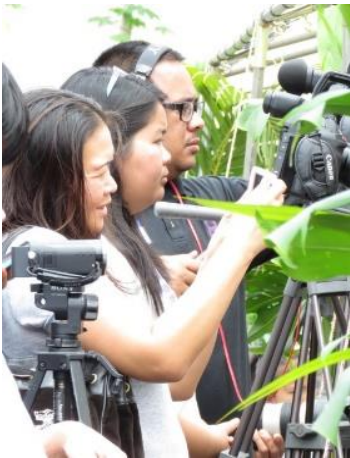
Waipahu Media Center sent a crew of 'Ōlelo staff to film this event. Mahalo plenty.