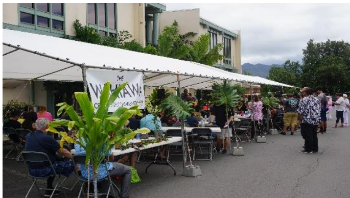
More than 100 people signed the register as participants of the day's events. Mahalo for the community support.