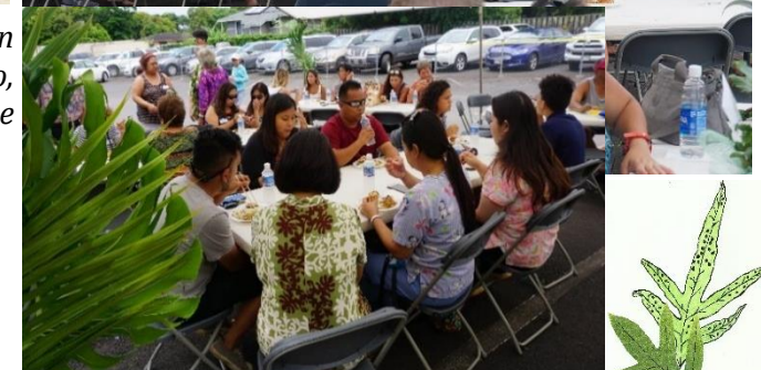
A full house of guests and friends of WCCH