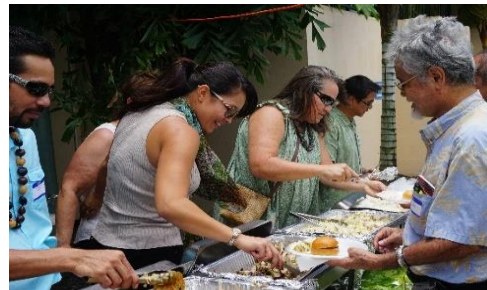
Friends of Kūkaniloko assist in serving.