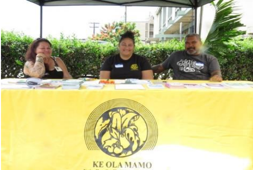
Ke Ola Mamo had a booth to share their information with our guests.